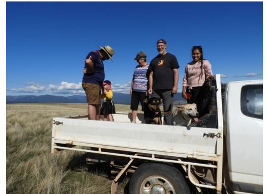
Travelling on the ute tray gave her a great view of the livestock and kangaroos