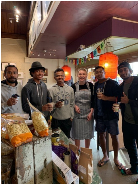
The workers visited The Produce Store