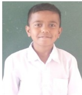
Longuinos de Sousa Bercoli Junior High