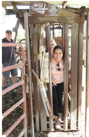
She learnt about many facets of farming in a very practical way