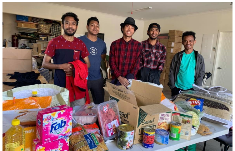
In May when incomes were reduced the workers were grateful for some extra supplies