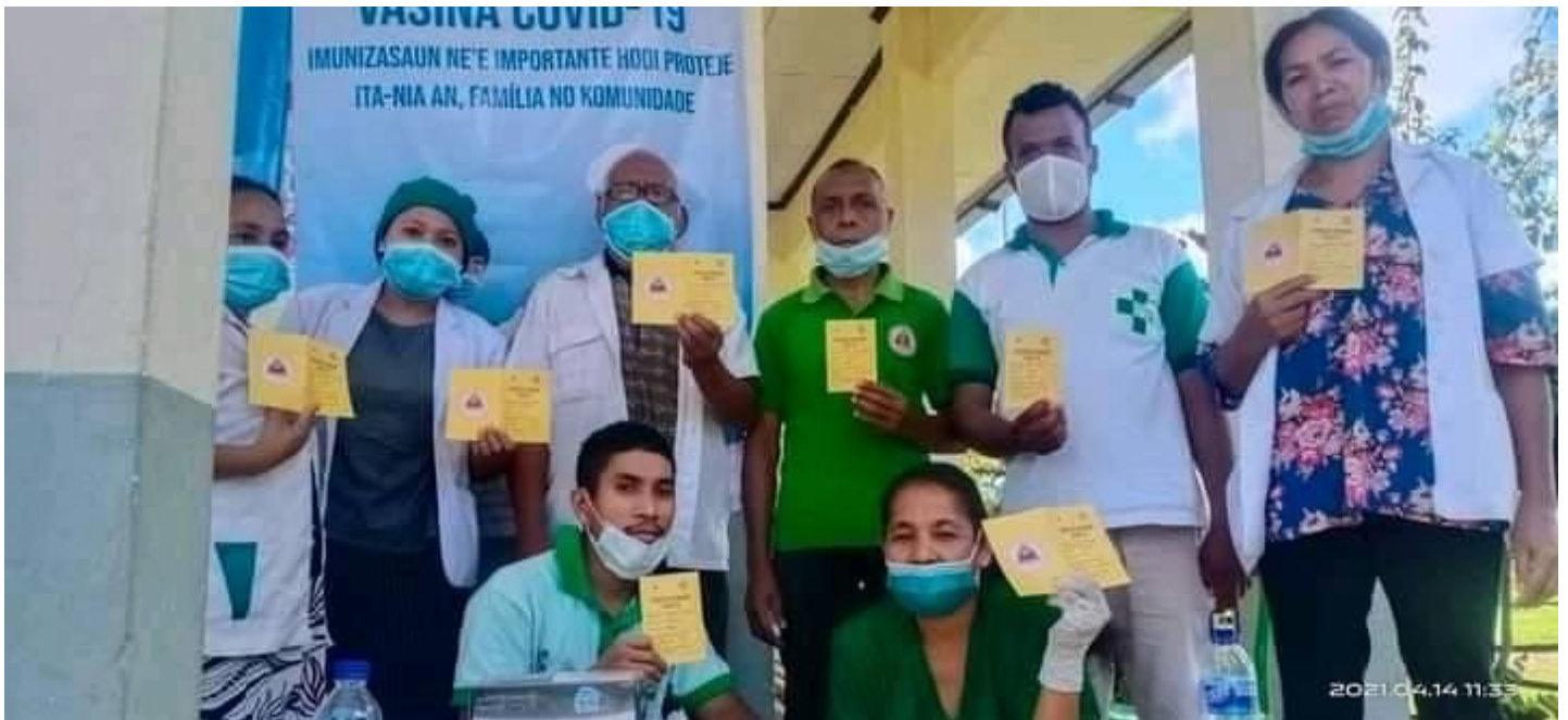
The staff at the Venilale Health Centre proudly display their vaccination certificates