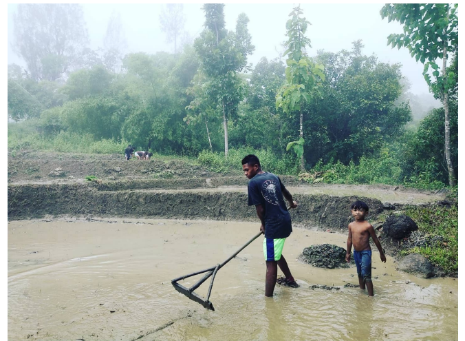
Preparing the rice field