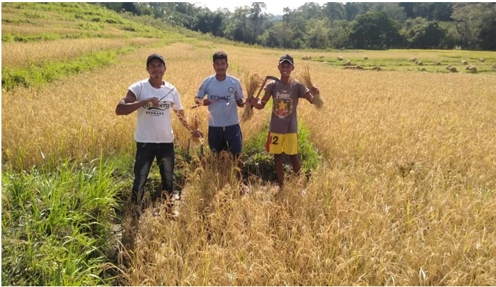
Harvesting the rice