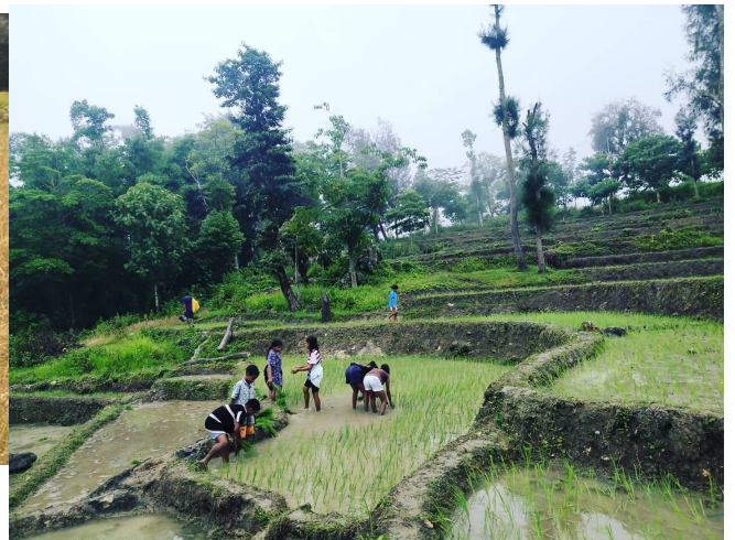
Sowing the rice for the next crop