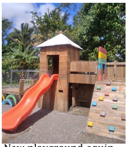
New playground equipment in Venilale