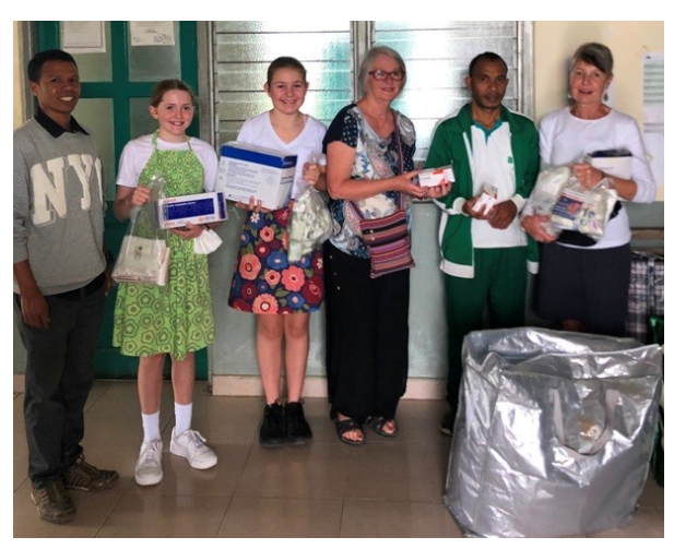
Delivering medical supplies to the Venilale Health Centre