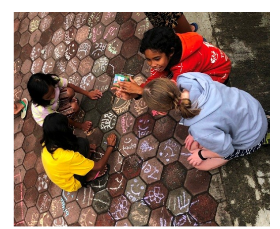
Building strong relationships with the orphanage girls through art and games