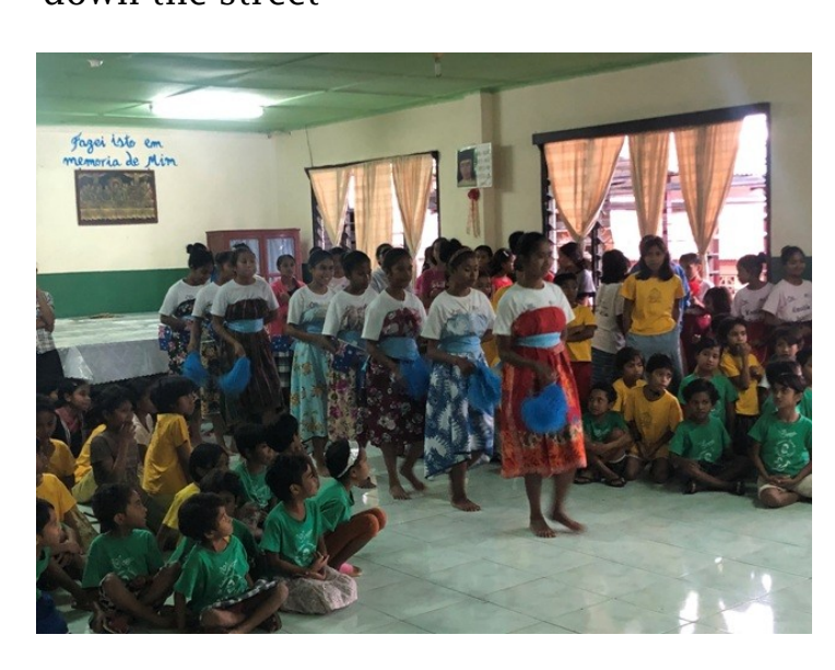
A farewell concert with traditional costumes, music and dancing