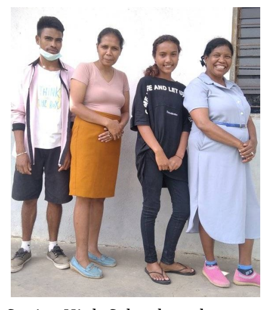
Senior High School students with their teachers

1 April -Mad Hatters' Tea Party at Crocketts