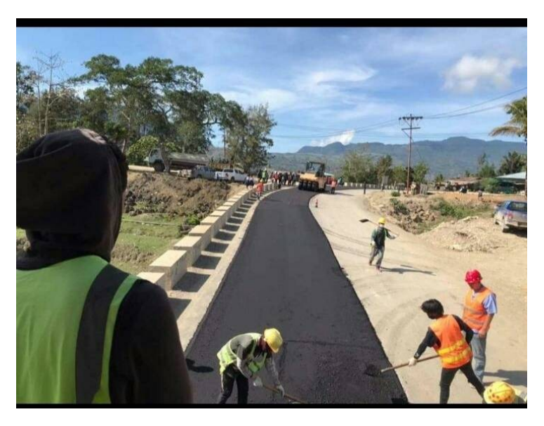
Road construction looks amazing on the Baucau to Venilale road