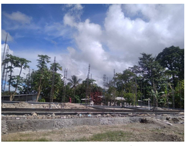
Foundations are laid for the new kindergarten