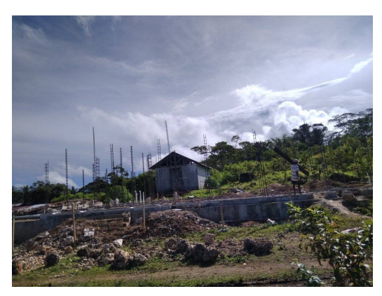
Uai Bua - the foundations are laid for the new staff room