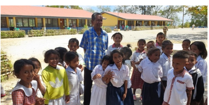
These Grade 2 students sang "If you're happy and you know it" in Tetun.