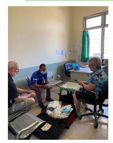
Delivering medical supplies to the Venilale Health Centre