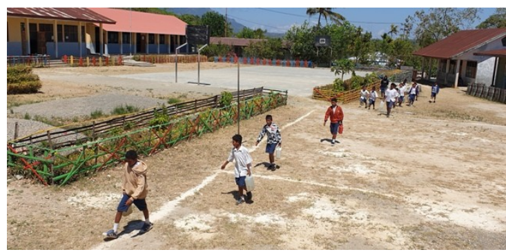
As you can see from the photo where students are carrying water (6 trips needed by each group) for toilets, the volleyball court is in a sad state. Uai Bua intends to use the funds to rebuild the court and have sent costings for cement, sand and labour.

Geelong Grammar School Timbertop raised $2,400 US for their partner Luga Oli Senior Secondary. Luga Oli has sent a quote for 2 blackboards, 4 laptops, 2 dictionaries for teachers of English, a large purpose made glass cabinet for science equipment and 2 tables for use during practical experiments.