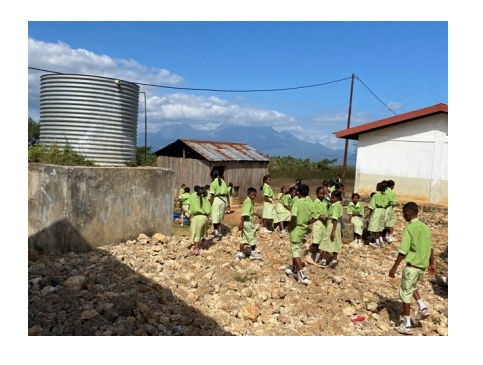
Students heading to the Bercoli School canteen to get a prepared lunch.