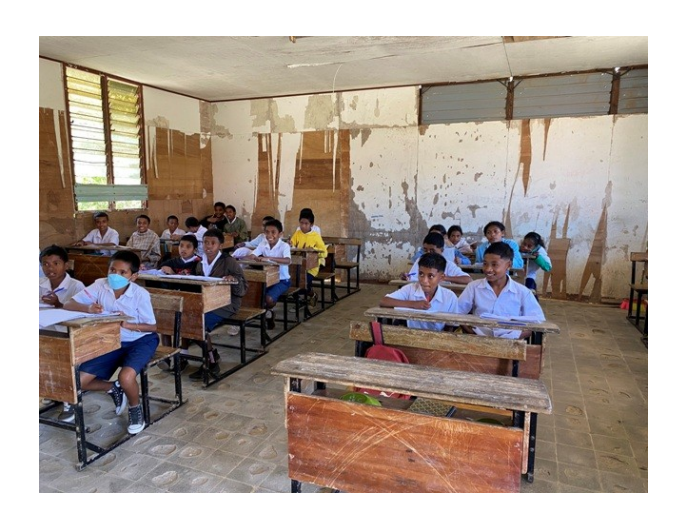
Lauriston Girls School Howqua Campus raised US$634 for their partner Uai Bua Junior High.

Geelong Grammar School Timbertop raised $2,400 US for their partner Luga Oli Senior Secondary. Luga Oli has sent a quote for 2 blackboards, 4 laptops, 2 dictionaries for teachers of English, a large purpose made glass cabinet for science equipment and 2 tables for use during practical experiments.