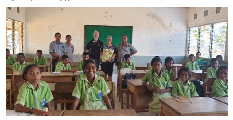
Grade 7 students loved having some Australian visitors.

Mansfield Secondary College students raised US$715 for their partnership school, Bercoli Junior High.