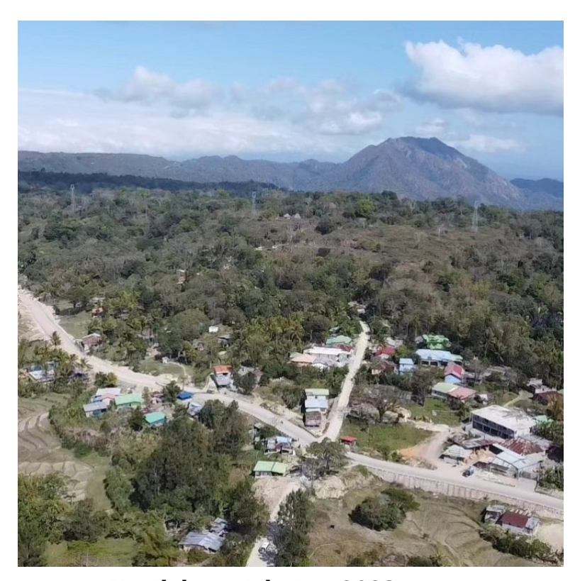
Venilale aerial view 2023